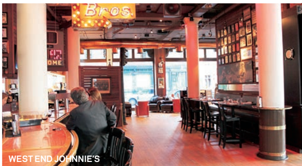
WEST END JOHNNIE'S